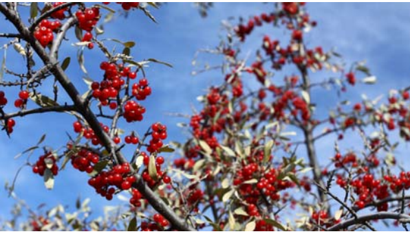
Redberries gave Redberry Lake its name

In 2000 Redberry Lake Biosphere Reserve was designated by the UNESCO and joined the global network of today's 580 biosphere reserves. There are 16 biosphere reserves in Canada – Redberry Lake Biosphere Reserve is the only one in Saskatchewan.