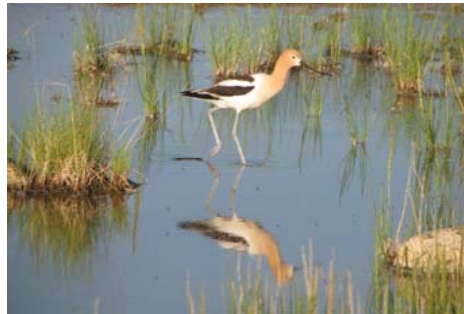
American Avocet

Redberry Lake and its four islands are a Migratory Bird Sanctuary and dedicated as an Important Bird Area (IBA). Bring your binoculars and enjoy watching Pelicans, Cranes, Herons and many more of our feathered friends.