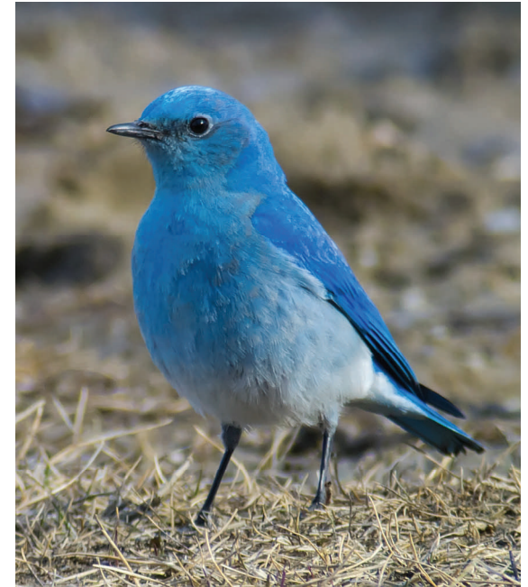
Mountain Bluebird