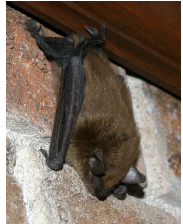
Big Brown Bat